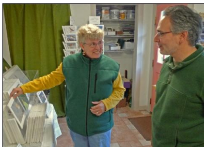
Open Studios 2011