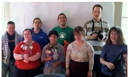
BCA supports SNAP – Special Needs Art Project