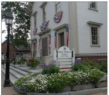
The BCA space is located on the ground floor of Bedford's Old Town Hall at 16 South Road