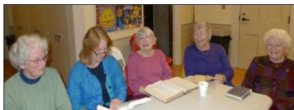
BCA's monthly play reading group