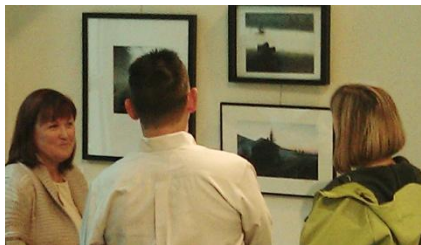
BCA photo group exhibit at the Bedford Library